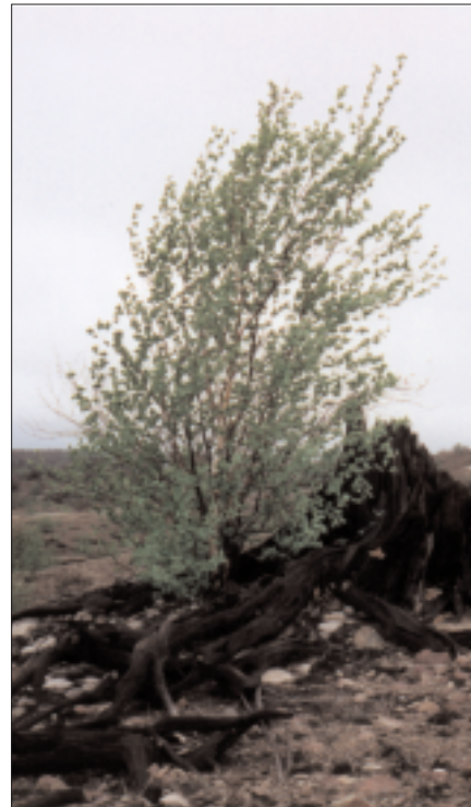
Falconbridge Mine Site, Sudbury – Black Stump with New Life

Sustainable development - elements of mine development that contribute to (impact) the sustainability of social and economic benefit, post mining, should be maintained and transferred to succeeding custodians. 3